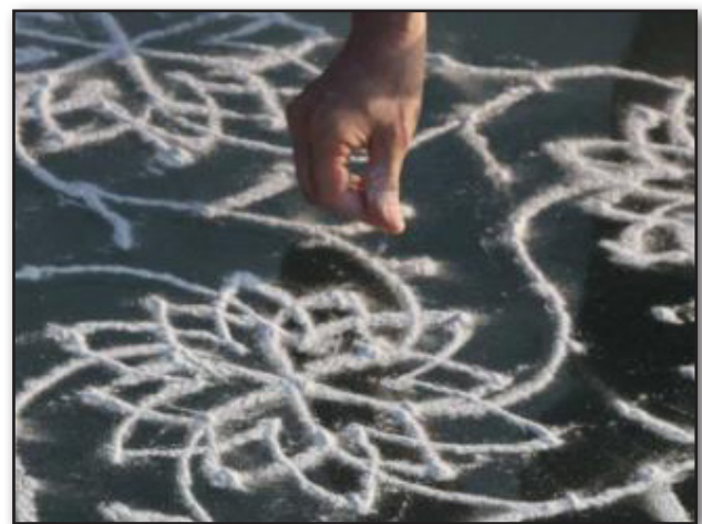
Fig.2. Geometric Designs of Kollam.