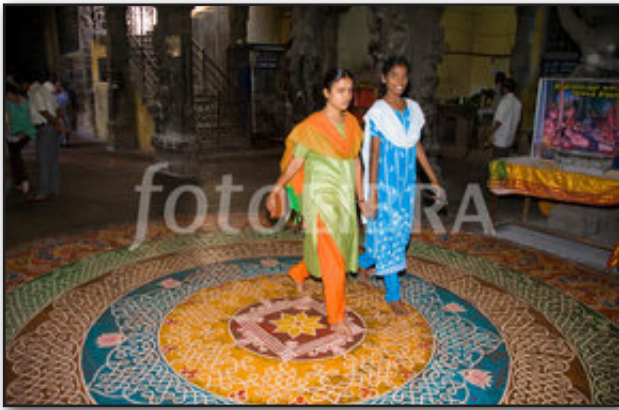
Fig.4. People walking through the Kolam represents their interaction with it.