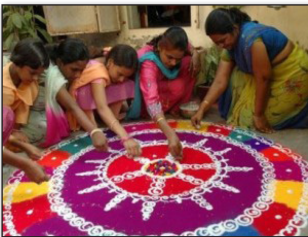
Fig.1. Indian women making Kollams.