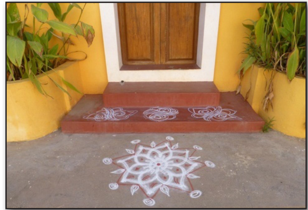
Fig.6.Kolam at the entries.

and basis, and consider it aligned with new art. In order to come to a better understanding of the similarities and differences of the two fields, in terms of the properties of New art, the following comparative table between land art and Kolam (Table1) has been arranged.