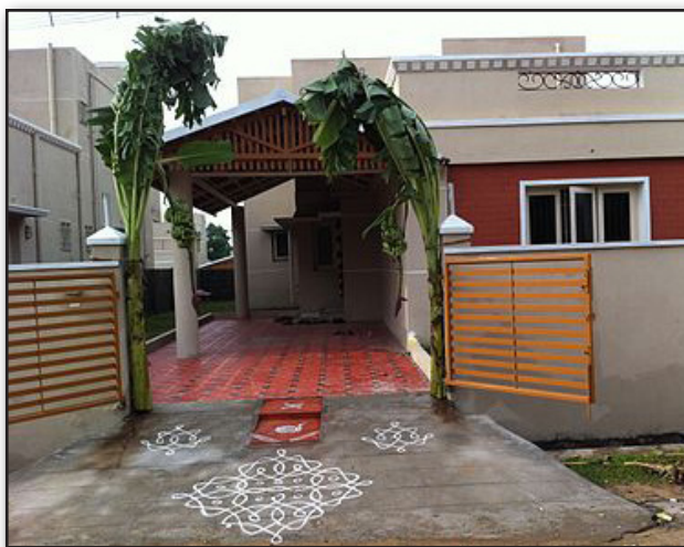
Fig.3.Kollams atthe entries.